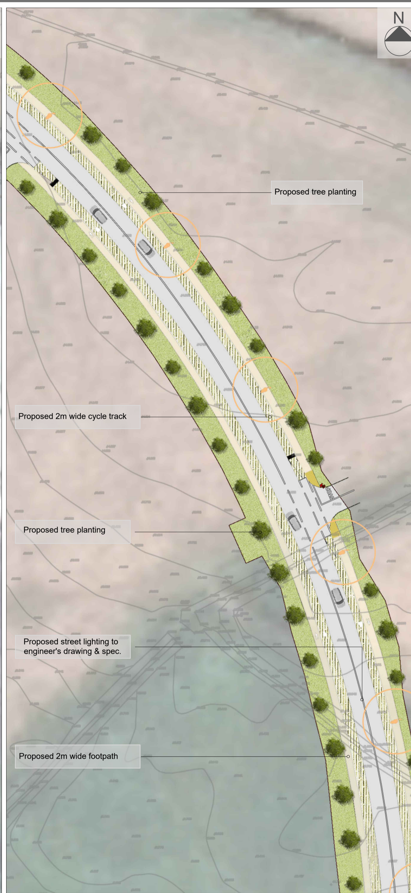
DETAIL AREA 9 ( scale 1:500 @A1)