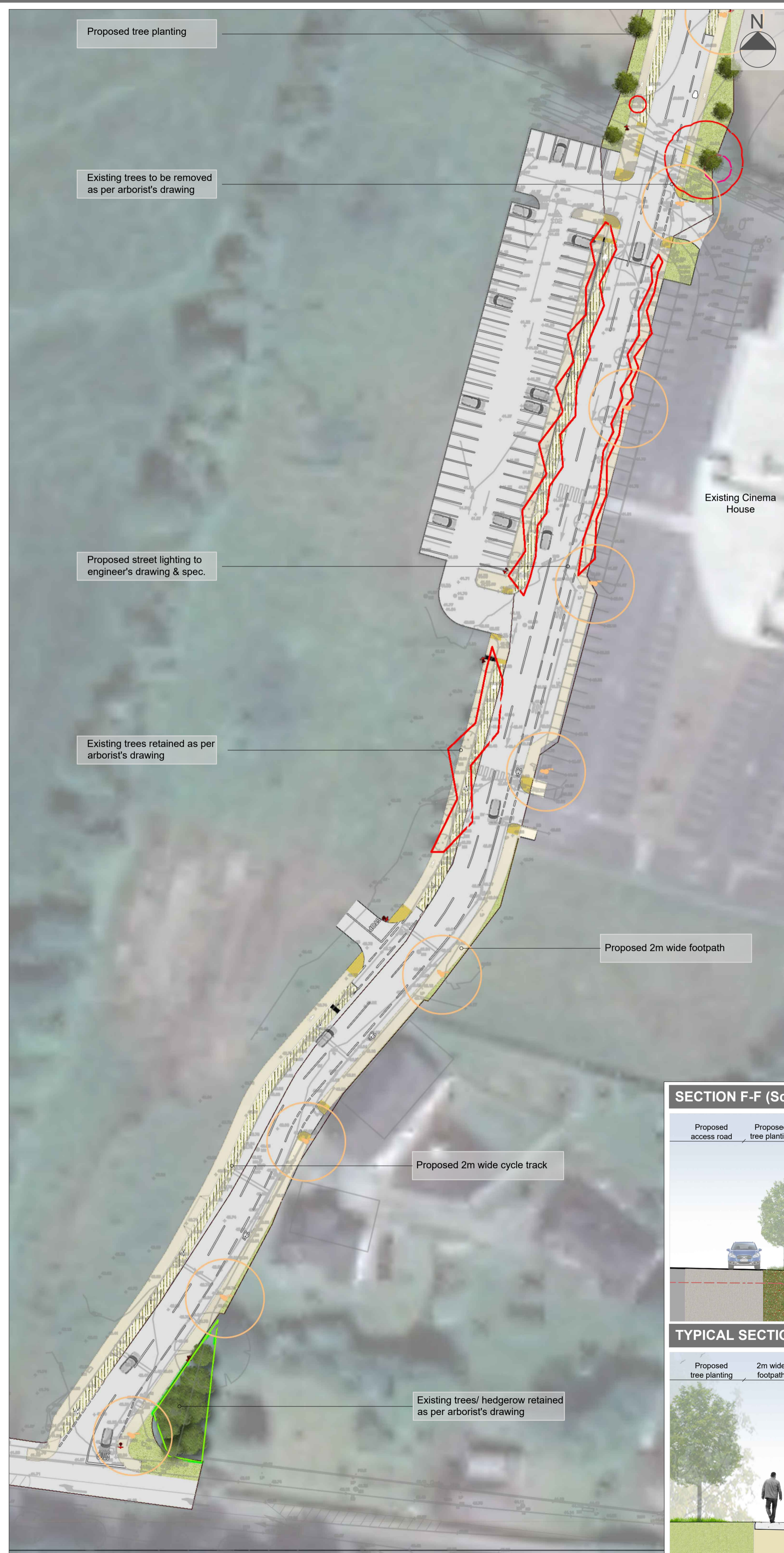
DETAIL AREA 8 ( scale 1:500 @A1)