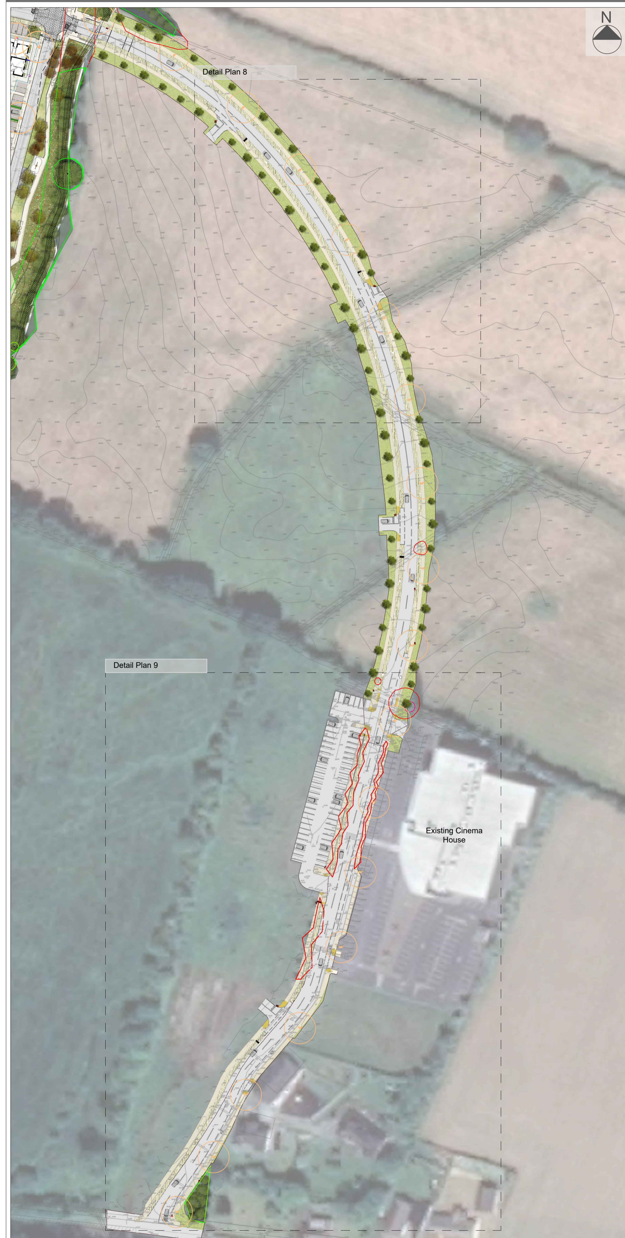
DETAIL AREA 7 (Scale 1:1000 @A1)